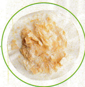
JUST 10% WASTE