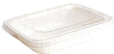
CLEAR RPET LID