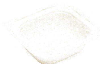
SEALABLE/PEELABLE PET FILM